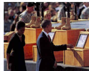
Above: The President and First Lady at the Memorial Service for the Victims of the 5 November Shooting.

area of operation. Some of the Soldiers have even been invited to have tea with local elders. The Soldiers morale is high, and soon the unit will start preparations for redeployment to Fort Hood. The unit would like to thank everyone for their support and say hello to all their fellow brothers and sisters in the Gauntlet at Fort Hood.