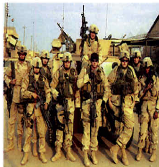
Above: Members of the BN in Tikrit Iraq 2003

2 January 1967- The BN is assigned the mission of securing convoys from Tan Son Nhut Airbase to the base camp of the 25th ID. This became the longest daily convoy conduct by US troops during the entire war.