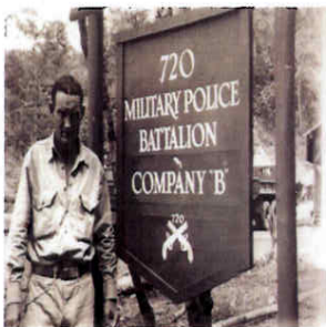
Above: Member of B CO (now 410th) in New Guinea 1942.

20 January 1942- The BN is activated at Fort George G. Meade in MD