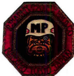
Above: Unofficial patch worn by members of the BN during garrison duty in Japan 1946-1949

2 January 1967- The BN is assigned the mission of securing convoys from Tan Son Nhut Airbase to the base camp of the 25th ID. This became the longest daily convoy conduct by US troops during the entire war.