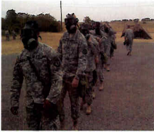
Above: 411th Soldiers prepare to enter the "gas chamber" as part of CBRNE training in preparation for the CCMRF exercise in Indiana.