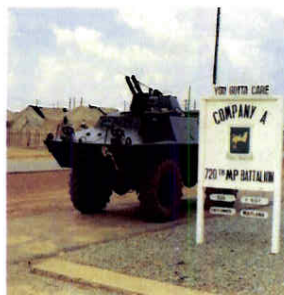
Above: BN VN100 in Vietnam 1969

30 September-31 December 1962- The BN is deployed to Oxford Mississippi to assist in the integration of Mississippi University