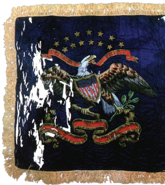
Cavalry Regimental flag, post-Civil War era

In 1891, Acting Secretary of War Lewis A. Grant renewed the idea of preparing a complete inventory of battles and skirmishes. This time the list was to be published in general orders rather than in the Army Register. (While the inventory was being prepared, the secretary instructed The Quartermaster General to issue colors and guidons without silver rings until the battle inventory was completed.) The list was submitted to the Secretary of War for publication in 1893, but he did not approve the compilation. Questions such as what should be considered a "battle" and what part of a regiment, battery or troop must have been engaged in order to be entitled to credit were unsettled. In 1900 and 1902 the 2d and 27th Infantry were informed that the list