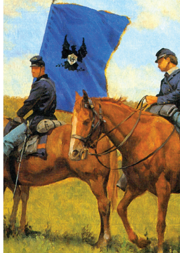
The flag of XIV Corps at the Battle of Chickamauga, 1863

It was determined that two or more companies of a regiment had to be engaged to have the name of a battle inscribed on the national color. The board based that number on tactics and regulations, which entitled a regimental battalion to carry the regiment's colors. (In 1878 a regimental battalion had no set structure.) As for regiments formed through consolidation as in 1815 and 1869, the board declared that the new unit inherited the honors of all previous organizations that now comprised it. 14