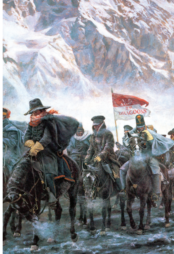
Dragoon guidon, 1857