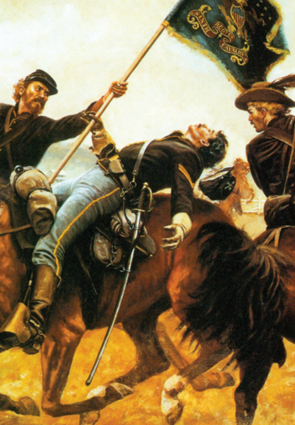
6th Cavalry regimental standard in the Battle of Gettysburg

battles and minor engagements and their dates. Evidently, the units never responded to the request, for no record has been found that any certificates were prepared. 26