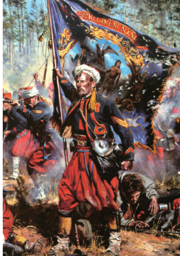
5th New York Volunteer Infantry Regiment during the Civil War