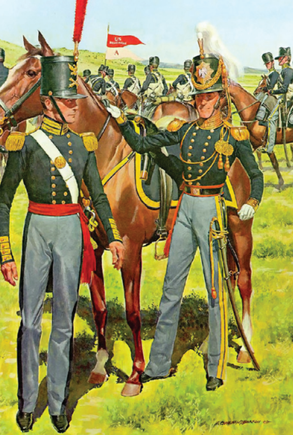
Dragoon Regimental flag, 1836

The orders for inscribing the names of battles on flags pertained to the national color, the Stars and Stripes, not to the regimental color. Infantry and artillery regiments carried both the national color and their organizational color. The national color had the name of the regiment embroidered on the center stripe, and the stars were gold although the regulations prescribed them to be white. Each artillery regiment carried a yellow color with two crossed cannon in the center, the letters “U.S.” above the cannon, and the designation of the regiment on a scroll below. Each infantry regiment flew a blue standard with the Seal of the United States (sometimes embroidered but more often painted) in the center; under the eagle, on a scroll, was the designation of the regiment. 6