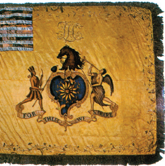
Flag of the Philadelphia Light Horse Troop, 1775

selected Army flags would display the streamers. President Dwight D. Eisenhower issued an Executive Order establishing the Army flag, which was unveiled on 14 June 1956 (the Army's birthday) in Philadelphia (the Army's birthplace). Because the flag had one streamer per campaign, the same system was adopted for units. 37