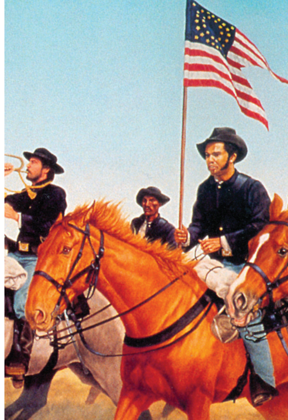
10th U.S. Cavalry Regiment flag in 1867

The new plan for displaying campaign credits cluttered the regimental flags, so in June 1920 the War Department changed the regulations again. This time the department directed each regimental color to bear streamers in the colors of the campaign medal ribbon for each war in which the regiment had fought. (Since no campaign medals existed for the Revolutionary War, the War of 1812 and the Mexican War, the Secretary of War was to prescribe the colors of the streamers.) The names of the campaigns were to be embroidered on streamers. If a unit participated in more than one campaign during a war, each streamer was to be inscribed with as many campaigns as possible. Under the revised regulations, a regiment displayed an honor if at least one regimental battalion earned it, and a separate battalion displayed an honor if two or more companies took part in the campaign. A company was not to receive credit unless at least one-half of its actual strength was engaged in the fighting. Once again, the names of battles and engagements embroidered on streamers were to be recorded in the Army Register above the list of officers of the organization. 31