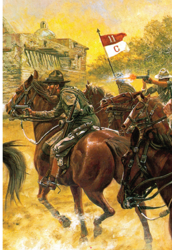
11th U.S. Cavalry guidon

Although the requisitioning of silver bands was held in abeyance, in 1915 Army Regulations authorized the Office of The Adjutant General to furnish each company, troop and battery with a suitably embossed certificate with the names and dates of all battles in which the unit had participated. The certificate was also to include the names of the enemy units engaged. A similar certificate was to be prepared for minor "affairs" of each company, troop and battery. When Troop K, 3d Cavalry and the 38th Company, Coast Artillery Corps requested the certificates, the Office of The Adjutant General returned the applications to the units and requested information about the