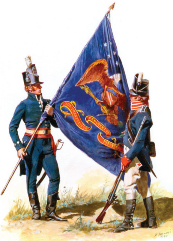
25th Infantry Regimental Standard, 1813–1814

With the new system to display battle honors, the Historical Section, Army War College, expanded the list of battles and campaigns in April 1921. There were now 94 campaigns: 13 for World War I, 10 for the Philippine Insurrection, three for the China Relief Expedition, three for the War with Spain, 13 for the Indian Wars, 25 for the Civil War, 10 for the Mexican War, six for the War of 1812 and 11 for the Revolutionary War. The inscriptions for the Indian Wars consisted of the names of the tribes involved but without the dates. Six months later two additional campaigns, one for the Indian Wars and one for the Philippine Insurrection, appeared on the list. At last the War Department had a comprehensive list of the Army's campaigns, a list that remained unchanged until World War II. 32