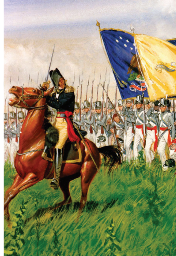
The Battle of Chippewa, 1814