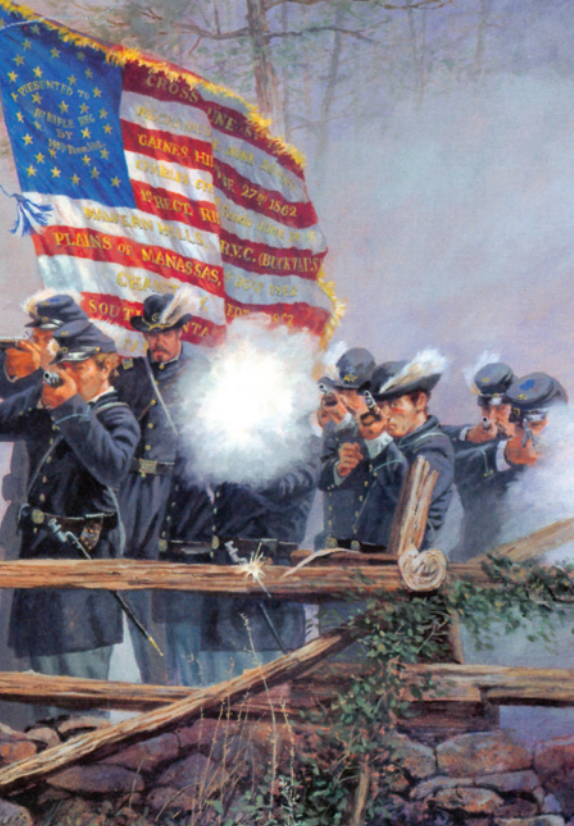
13th Pennsylvania Reserves flag with battle credits during the Civil War

of battles had not been completed; the following year the Office of The Adjutant General informed the 25th Infantry that the list had not been compiled and it was impracticable to make such a compilation at that time. In 1903 Francis B. Heitman, a former employee in the War Department, published the Historical Register and Dictionary of the United States Army. This unofficial work devoted more than 80 pages to listing the battles of the Army from 1775 to 1902. 20