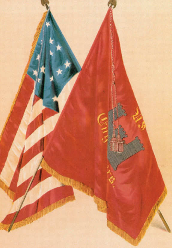
National and Battalion Colors of the Battalion of Engineers

The board also explored the question of how detached artillery batteries should display their battles. It determined that artillery batteries (as well as cavalry) were entitled to bear on their guidons the names of battles in which they served independently. Furthermore, The Adjutant General was to place the names of those battles in the Army Register next to the letter of the battery. Battery honors were not to include those to which its parent artillery regiment was entitled, but only the battles in which the battery had served independently on detached service. Since all artillery batteries were entitled to carry guidons, the board thought it was appropriate to determine whether detached batteries having served as infantry should inscribe the names of their battles on the guidon. Although such a determination seemed fitting, the board side-stepped the issue. 15