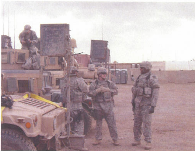
LEFT: Soldiers of 3rd squad are seen on a recon mission to a Fallujah base.