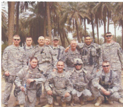
The commander's mighty security squad takes time to pose for a picture. "You guys are awesome!" -GF6

Second platoon, Punishers!, felt the heat of opening up new stations in their district in November and December and did a phenomenal job! Their stations now run nearly independently with aid from the squads