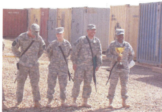
LEFT... HQ seen receiving the Commander's Cup for their win in the Volleyball tournament.