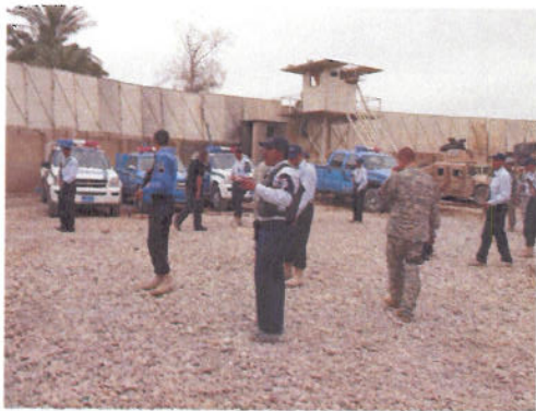
LEFT: Soldiers from 3rd platoon conduct training of their IP counterparts at a JSS. RIGHT: The Iraqi Sun in the middle of a "sandy" afternoon.