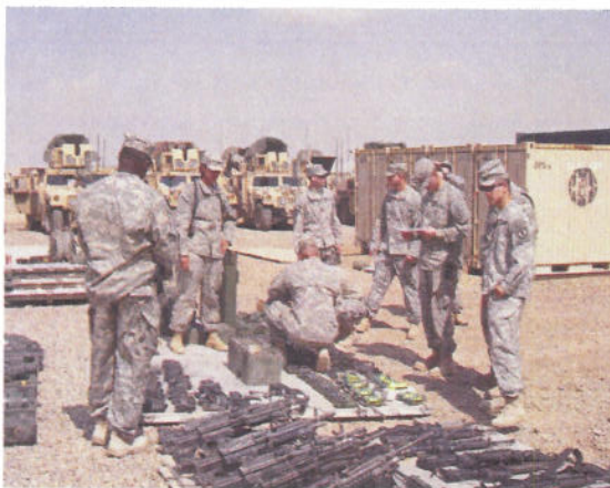
LEFT: Another layout...Soldiers conducting a complete sensitive item layout. RIGHT: Soldiers from 1st squad seen outside their JSS.