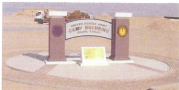
Above... Camp Buehring - the 401st arrives at its temporary home (May 19th). Below... Training in the Kuwaiti desert preparing for the push north (May 24th).

RIGHT.. Sandstorm strikes hard at Buehring—delaying the 401st's movement north. (June 1st)