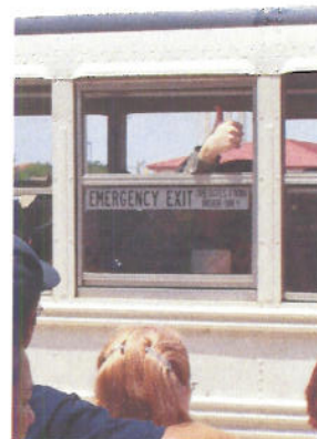
THE 401st SAYS GOOD-BYE TO FAMILY AND FRIENDS AT THE GYM. MAY 14, 2007