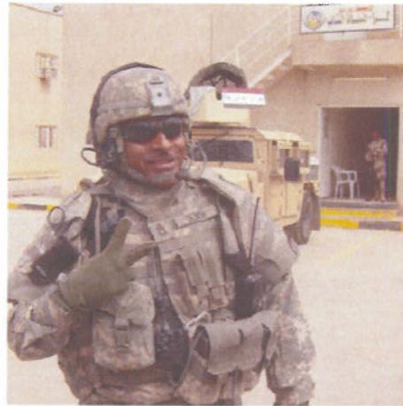
LEFT ...SFC Senior is seen outside of a police station checking on Soldiers.