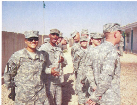
Several Soldiers from HQ seen just before a platoon formation.

Thank you to the friends and family members for your continued support and allowing our Soldiers to be successful daily. Beside every great Soldier, is an even greater family member supporting us and allowing us to do what we do everyday. GUNFIGHTER 5, OUT!