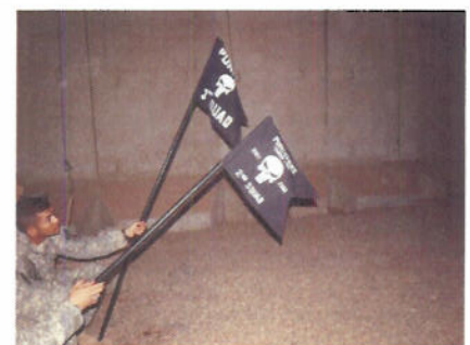
A couple of Punisher guidons at a recent Punisher activity.

“If all men were just there would be no need for Punishers.”